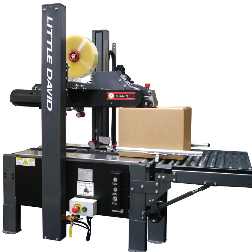
LDX-RTB shown with optional pack table

Automatically adjusting for height and width, cases are then top and bottom sealed.